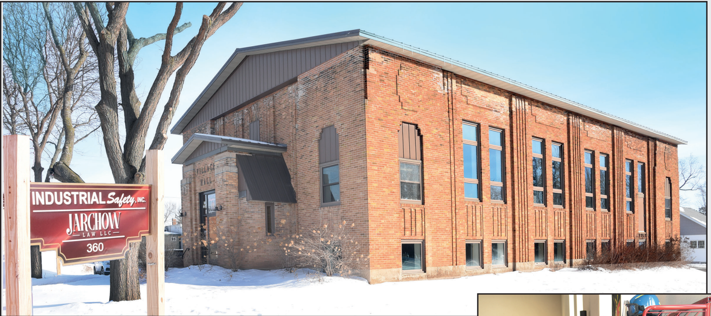
Industrial Safety Inc. operates their business out of the old Village Hall building.