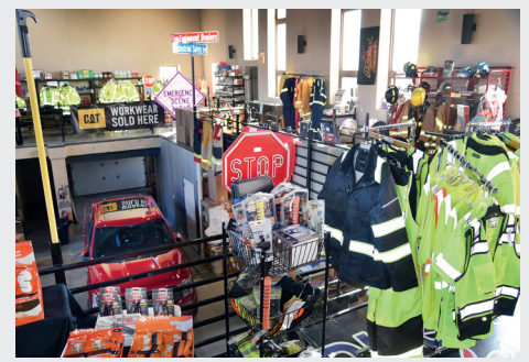
Industrial Safety's large variety.