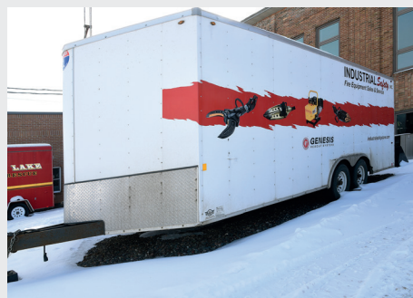
On site delivery trailers.