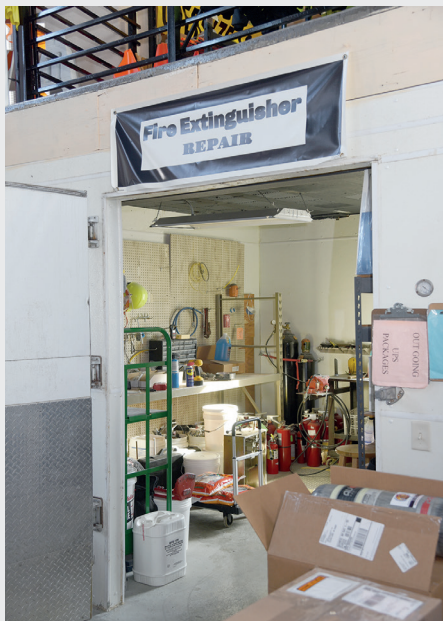
Equipment repair services