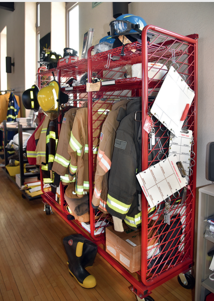
Everything from turnout gear to the racks.

Take a look at the Industrial Safety, Inc. ad on page 27 of this issue and consider giving them a call before you make your next purchase!