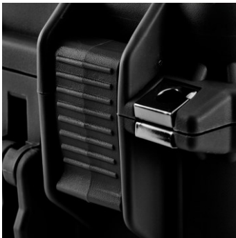
Metal reinforced eyelets