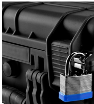
Easy open latching